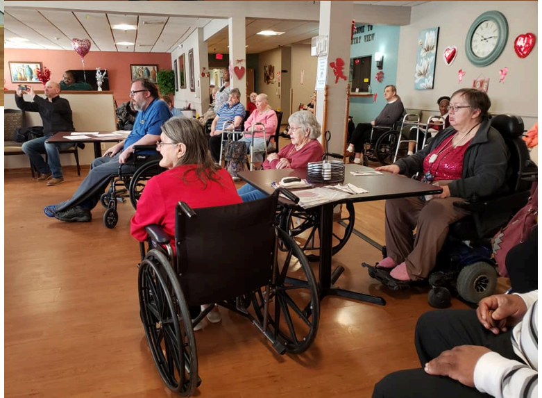
Valentine's celebrations with family, community and staff!